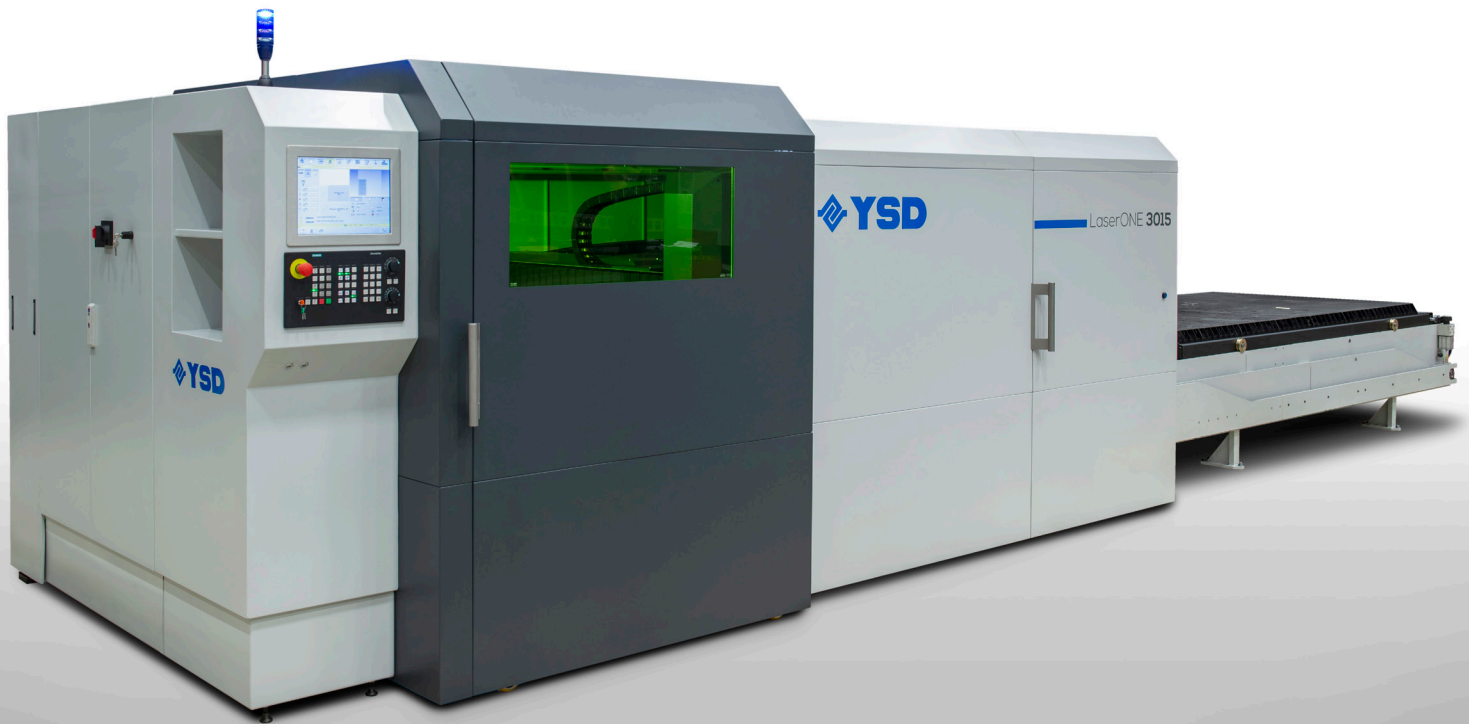
Machine shown with optional full machine covers

The advantages of fiber laser now within easy reach.